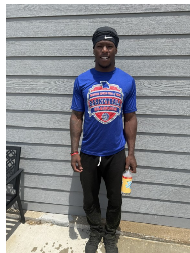
Temporary Summer Laborer